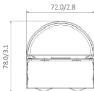
SR2 LENS Standard Version 2